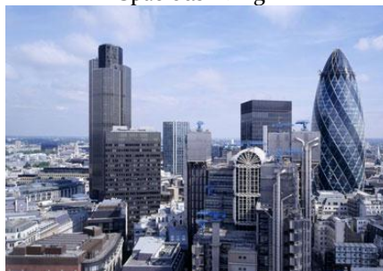
The historic Square Mile