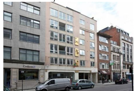
Prestigious small block