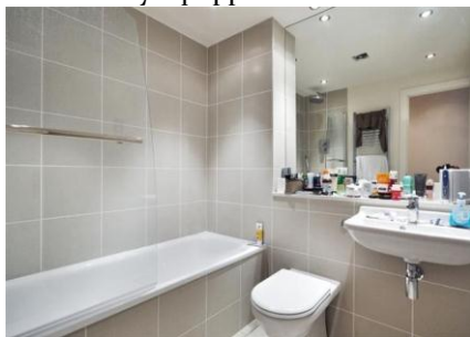
Master bedroom with en suite