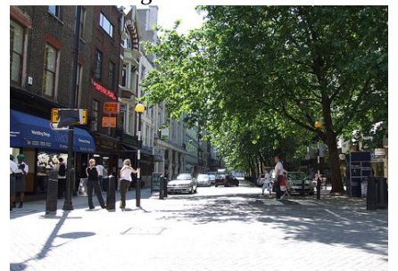
Bright Hatton Garden sopping