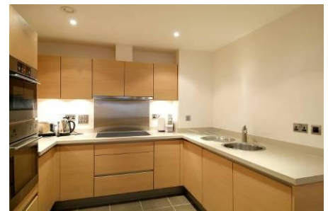
The St James' Apartment Kitchen