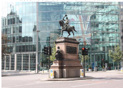
Holborn Circus nearby