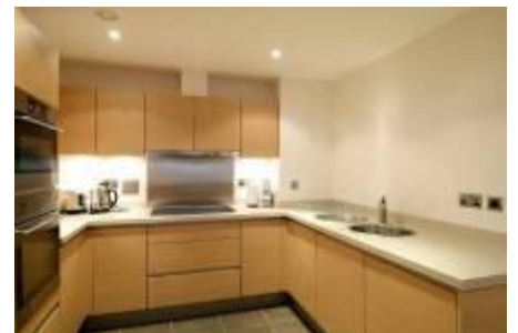
The St James' Apartment Kitchen