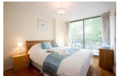
The Waterloo Apartment bedroom