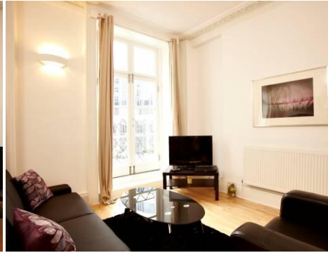
Bright living areas