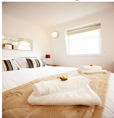
All linen provided