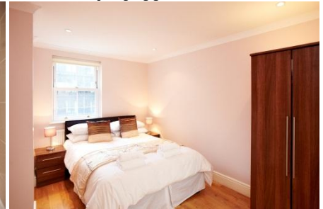
Great second bedroom