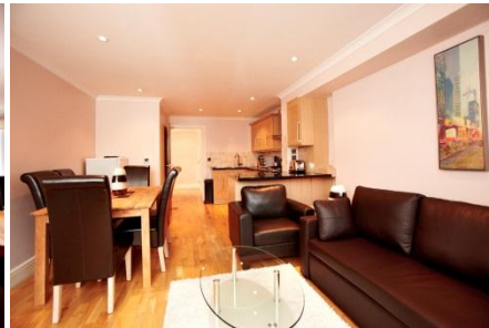
Bright living space