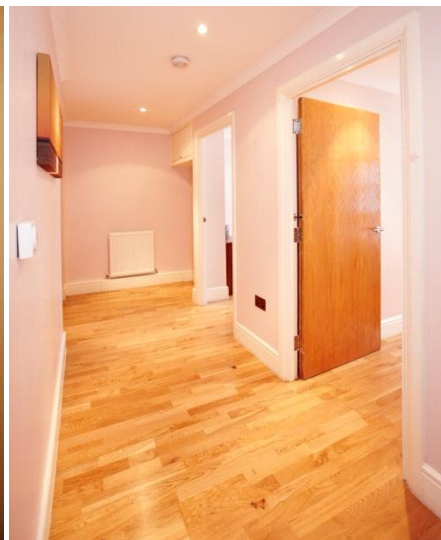
Space to move