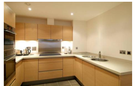
The St James' Apartment Kitchen