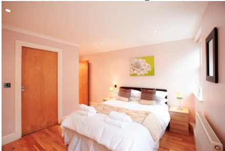
Bright main bedroom w en suite