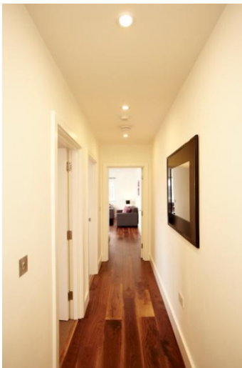
Room to move