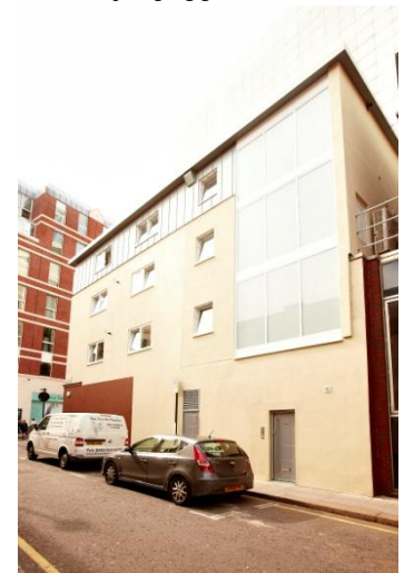
Modern secure block