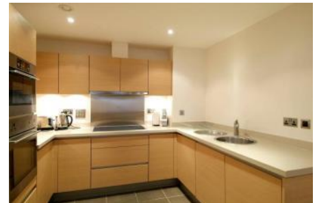
The St James' Apartment Kitchen