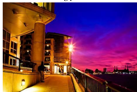
The River bank at night