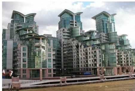
Prestigious apartment complex