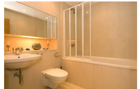
Fabulous bathroom facilities