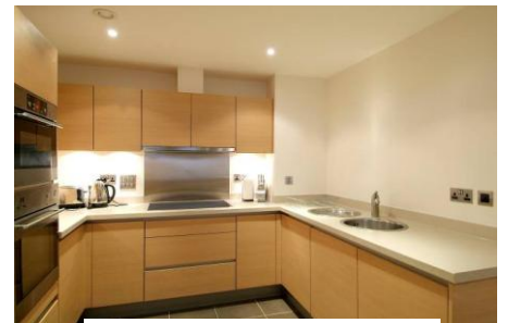
The St James' Apartment Kitchen