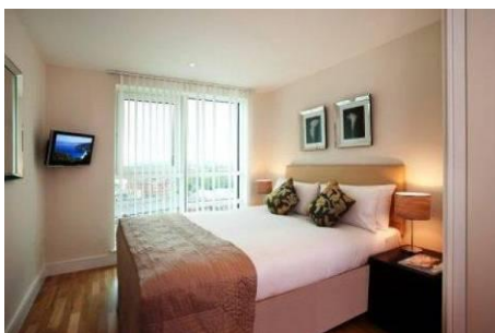
The second bedroom