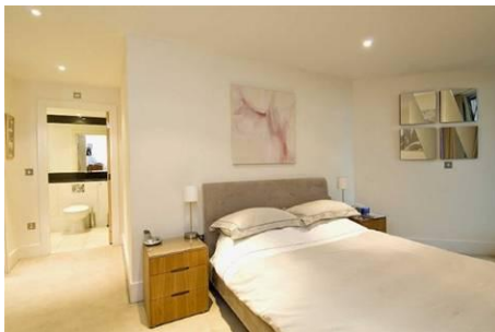
Main bedroom with en-suite